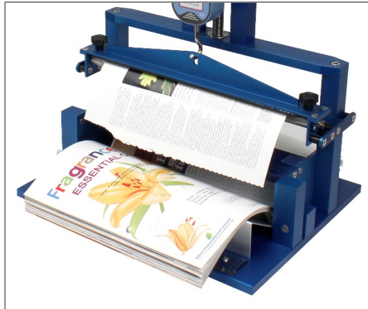
Release the page

Lower the gripper bar by turning the top wheel anti-clockwise until the gripper bar is close to the V-stops as at the start.