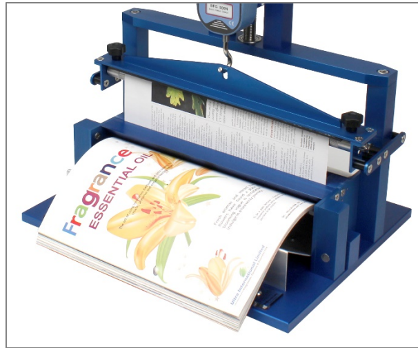
Tester pulled up for page removal

Ensure the force gauge is on, zeroed and in the correct operation mode (set to max and tension). Tighten the gripper bar clamp thumbscrews, ensuring that the page is straight and centred in the clamp. As the top wheel is turned, the book spine is drawn up against the V-stop.