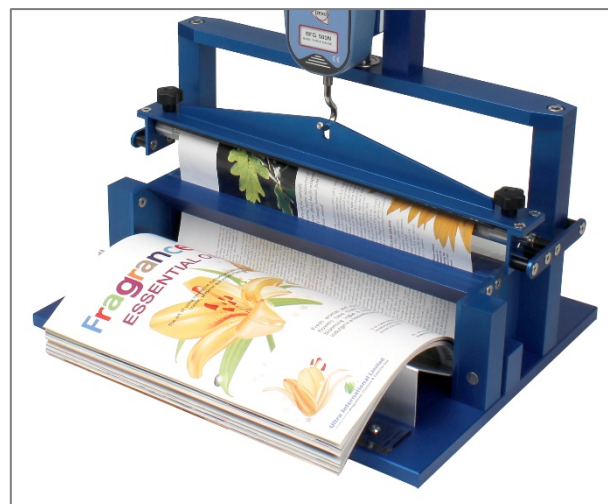
Tester with page passed into the gripper bar

Adjust the position of the gripper bar to approximately 1 cm from the V-stop using the top hand wheel, to allow sufficient vertical travel to complete the test. Loosen the gripper bar clamp thumbscrews, and feed the page, or pages, between the gripper bar and rubber covered clamp bar: