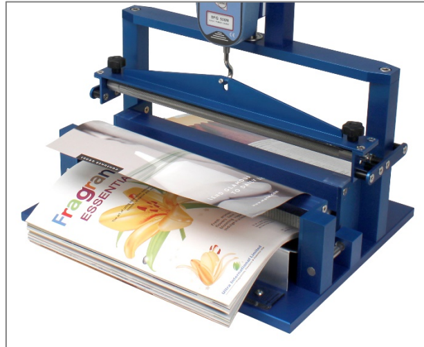
Tester with page fed between the open V-stops

Feed the desired page, or pages, between the V-stops: