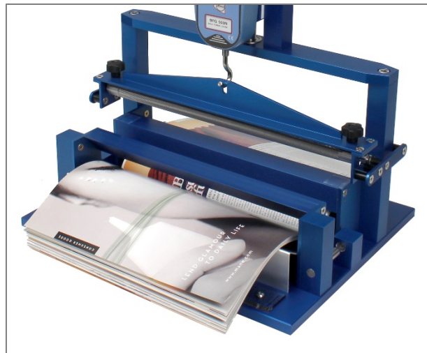
Book placed on Page Pull Tester, V-stop opened

Place a book on the sample support, with the open pages uppermost. For larger books it may be necessary to remove the sample support. Ensure that the book is centred under the gripper bar and between the uprights. Open the V-stop by pulling the detachable bar forwards: