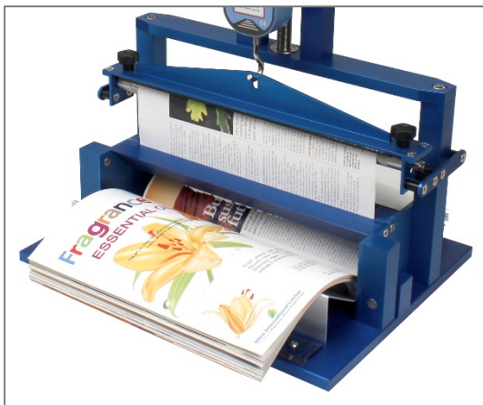
The binding has failed

Loosen the gripper bar clamp thumbscrews and remove the torn page.